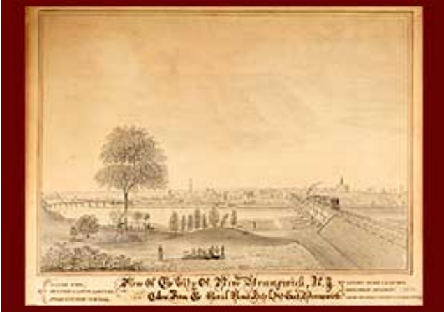
1845 pencil sketch of New Brunswick by C.C. Abeel, based on a lithograph by J.H. Bufford.